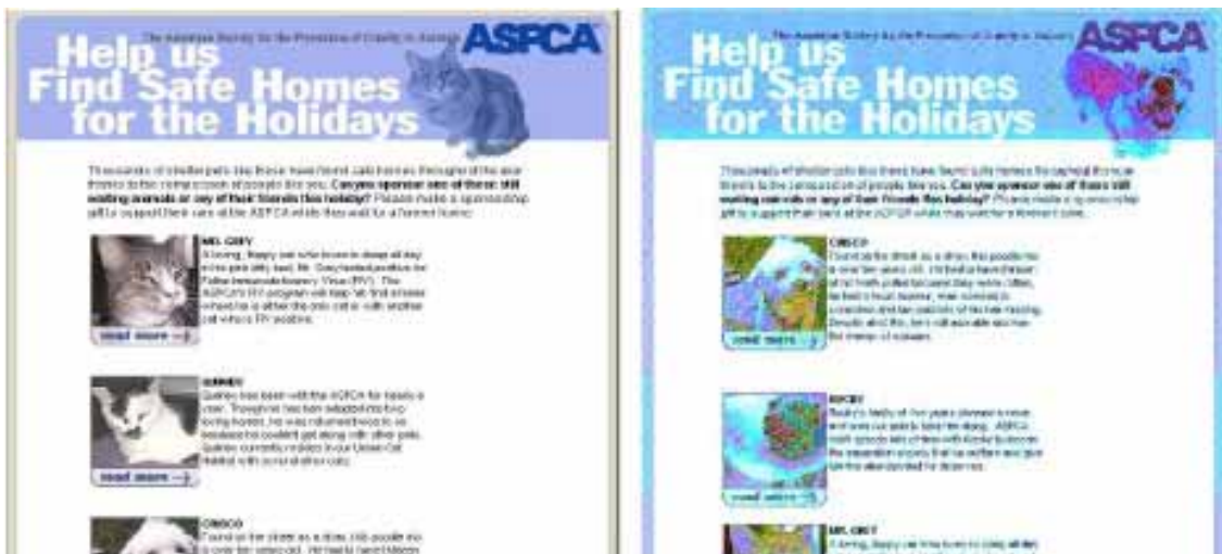
Figure 11. ASPCA 2003 Holiday Campaign